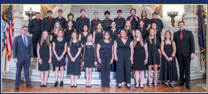
The Bermudian Springs High School choir brought their beautiful voices to the Capitol. The group graced us with a little concert, and I had the pleasure of taking them for a tour of the state House.